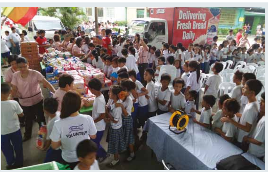
Gardenia Philippines' Nutrition Assistance Program aims to reduce malnutrition in less privileged schoolchildren.

In the Philippines, Gardenia put some 1,800 students from eight public elementary schools in Luzon and Cebu under its Nutrition Assistance Program for a period of one year. The Nutrition Assistance Program is a health advocacy initiative and a feeding program that aims to reduce malnutrition in less privileged schoolchildren. Under the program, children were taught the importance of eating a well-balanced breakfast and provided with free bread. The nutritional status of the children and their performance in school will be monitored for signs of improvement.