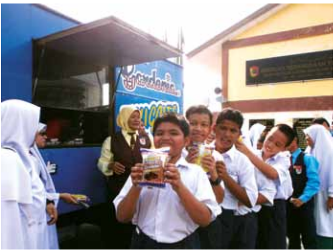
Twiggies Wagon distributing free Gardenia Twiggies buns to the students of Telok Gadong Primary School, Klang, Malaysia.

In Malaysia, Gardenia has been supporting more than 65 charity homes with regular product donations since 1991. In 2015, Gardenia donated more than 250,000 units of bakery products to various charitable causes, including the Orang Asli Settlement, single parents, the homeless, and in support of blood donation drives.