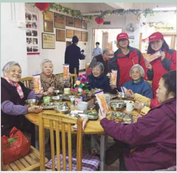
▶ Gardenia volunteers bring cheer to a nursing home in Fuzhou city.