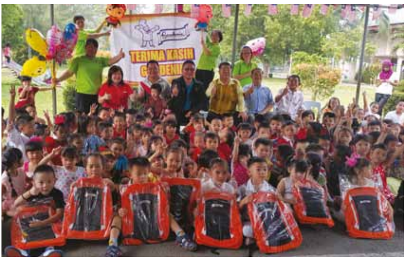
Children of a village in Jenjarom, Selangor receive free school bags under Gardenia's Bag-to-School Program in 2015.