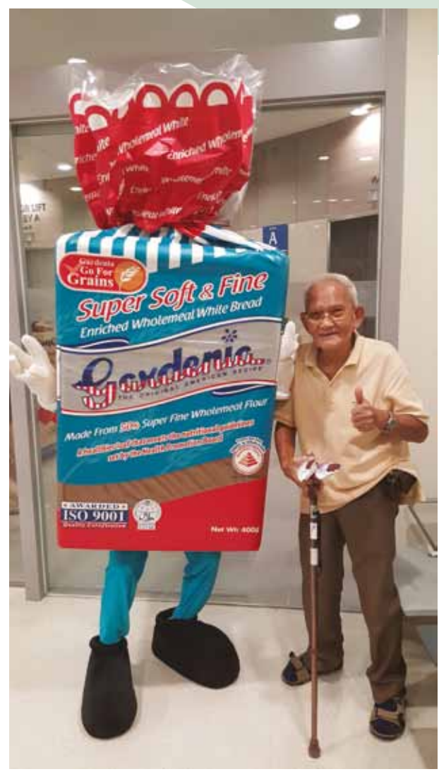
► Gardenia spreads the message of eating more whole grains during the World Bread Day event at the Ng Teng Fong Hospital in Singapore.

We are in a position to make efficient use of the world's limited food resources to produce healthy and nutritious foods that improve the quality of life of our customers.