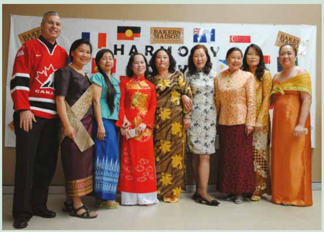
▶ The multi-racial employees of Bakers Maison celebrate their diversity by donning their national costumes on Harmony Day.