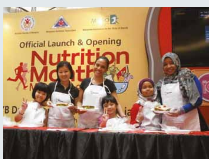
Healthy Sandwich-making Competition at the Nutrition Month Malaysia Carnival 2015 aims to teach the young the importance of healthy eating habits.