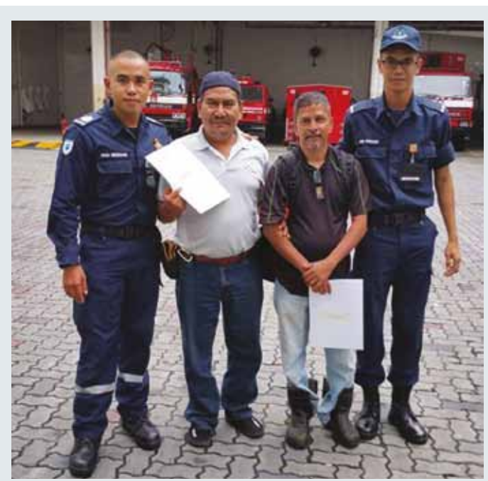
► Four NCS personnel attend the fire safety and first aid programs conducted by the Singapore Civil Defence Force.

Rivalea's in-house Rehabilitation Centre aids in the speedy recovery of any injured worker and provides safe alternative duties, rehabilitation, and exercise programs. An online integrated incident reporting system also allows for real time incident reporting to enable speedy investigations.