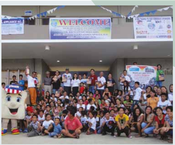
➤ Gardenia employees visit the SOS Children's Village in typhoon-ravaged Tacloban to treat the children to a day of food, fun and presents.